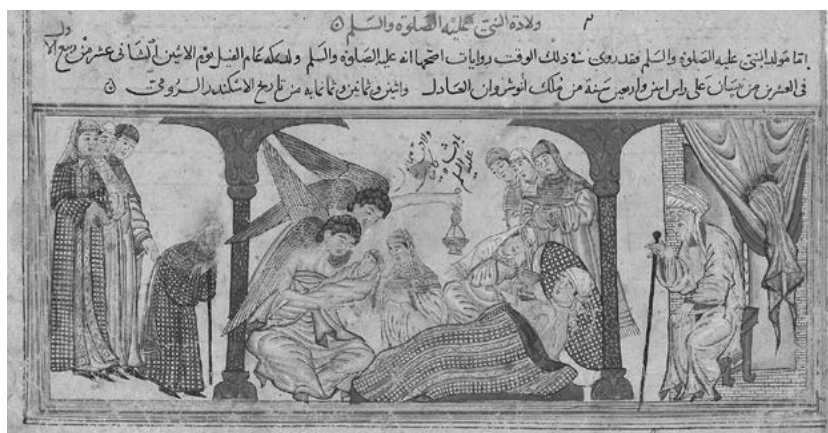
Fig. 2. The birth of the Prophet Muhammad in a thirteenth-century Iranian “compendium of chronicles.”

has become filled with the breath-soul-of-life.” The allusion here, as in the just-cited condemnatory hadith, is to the Koran: “O Jesus, son of Mary. . .you did make out of clay, the figure of a bird, by My leave, and you did breathe into it, and it becomes a bird, by My leave” (5:110). Notice how the same verse of the Koran—whose bird story, by the way, is borrowed from the Christian Infancy Gospel of Thomas—can be used to praise the making of art in Islam, or to prohibit it. And although today’s ayatollahs might insist that only the latter use is Islamic, tens of thousands of lavishly illustrated Persian manuscripts suggest that their ancestors were just as open to the former. (For a digitized sample of fifty of these manuscripts from the British Library’s holding of roughly eleven thousand, see http://www.bl.uk/projects/digital-access-to-persian-manuscripts .)